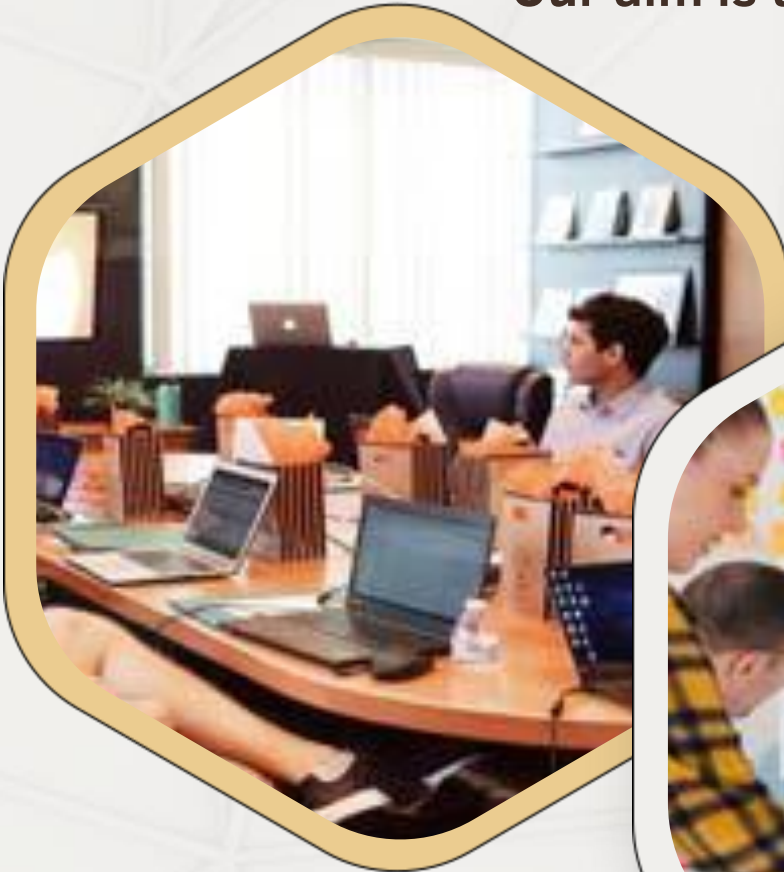
Instructor-led Classroom Training

Our aim is to help you with capacity building on long and short term in alliance with your company competencies and culture.