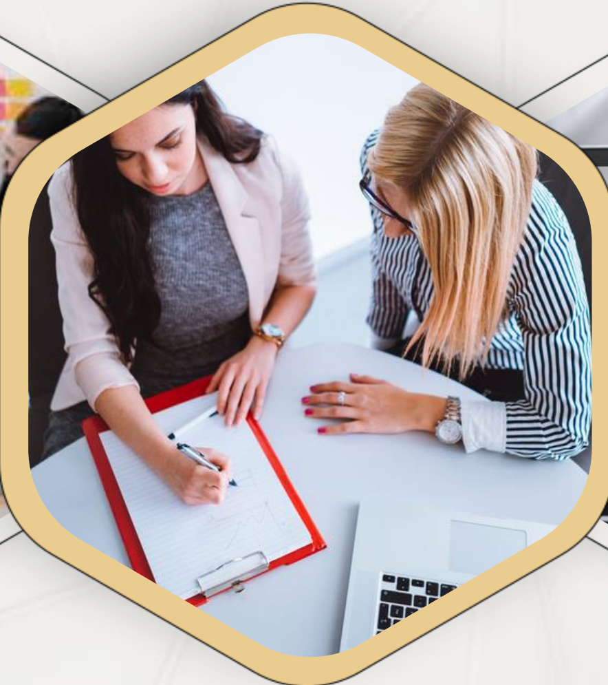
Executive & Team Coaching