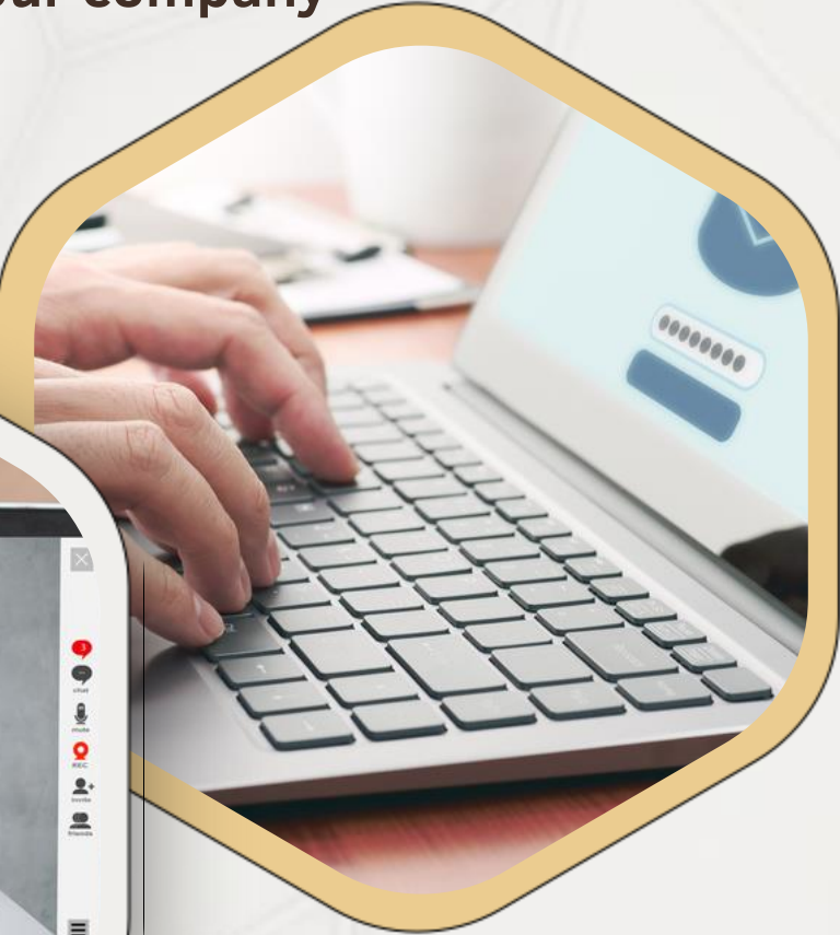
Training on Demand (E-Learning)