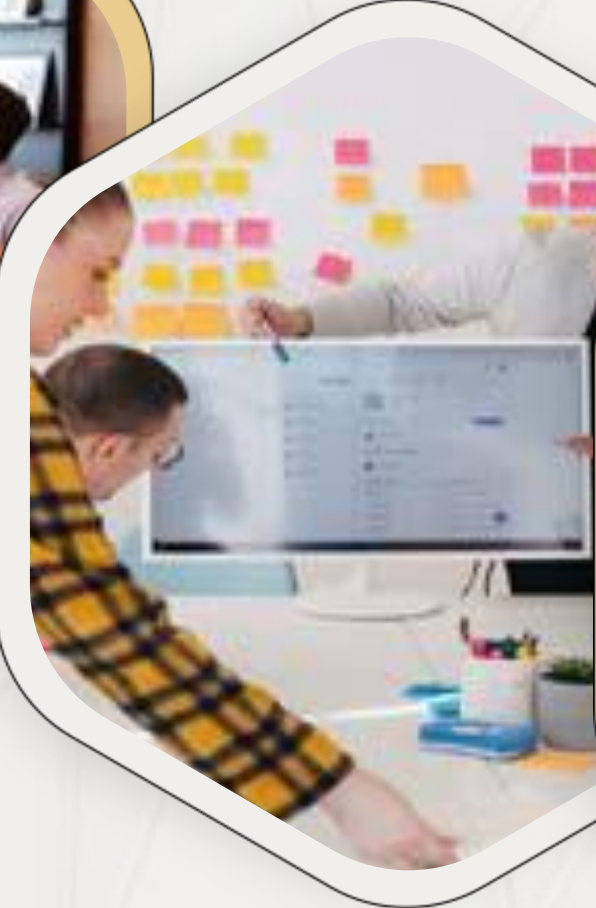
Group Activities and Gamification