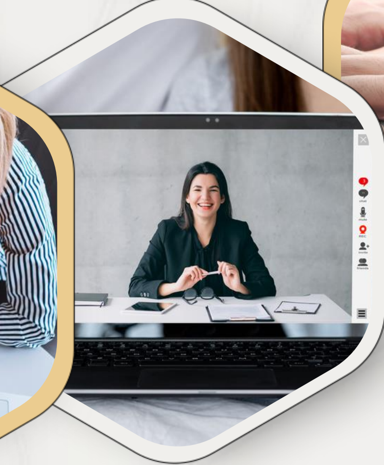
Live Online Training